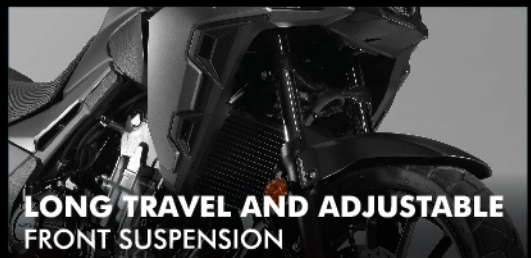
LONG TRAVEL AND ADJUSTABLE FRONT SUSPENSION

Ignition Type Full Transistorized, Battery | Spark Plug Type NGK CPR8EA-9 | Front Headlight Hi 12 W x 1 (LED) | Rear Headlight Low 4,8 W x 1 (LED)