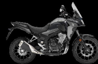
MAT GUNPOWDER BLACK METALLIC