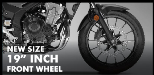
NEW SIZE 19" INCH FRONT WHEEL