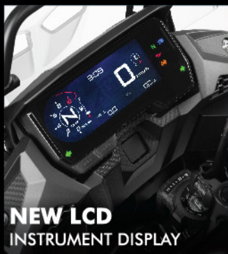
NEW LCD INSTRUMENT DISPLAY