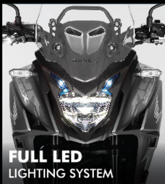
FULL LED LIGHTING SYSTEM