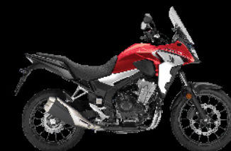
GRAND PRIX RED