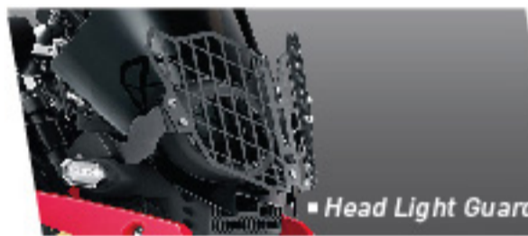
Head Light Guard