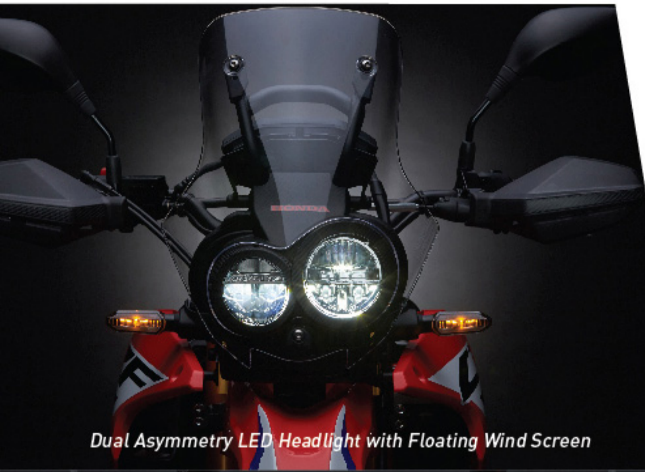
Dual Asymmetry LED Headlight with Floating Wind Screen