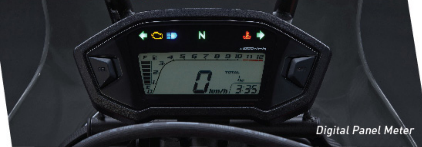
Digital Panel Meter