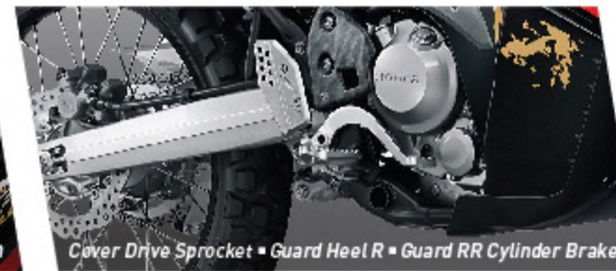
Cover Drive Sprocket • Guard Heel R • Guard RR Cylinder Brake