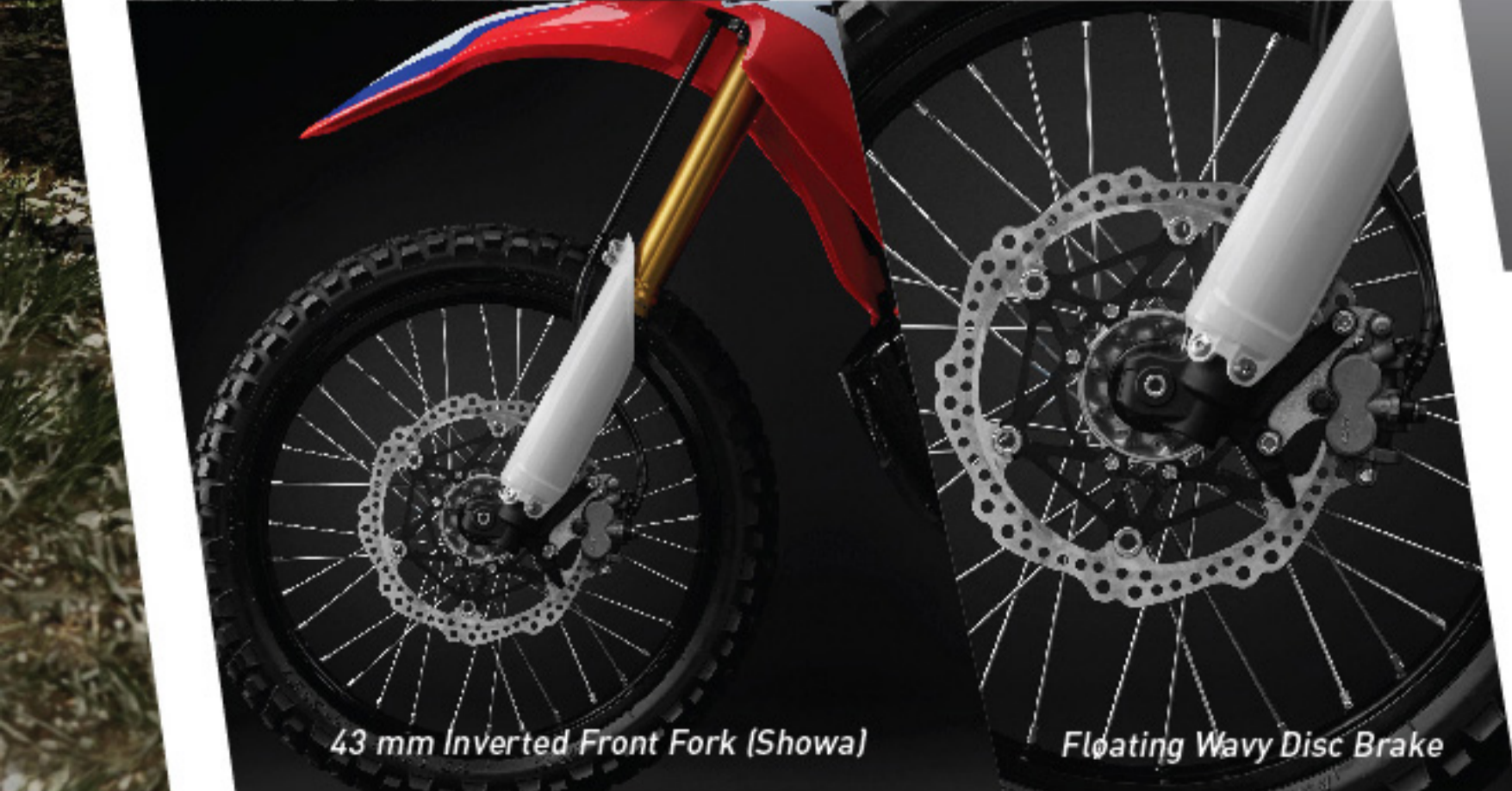
43 mm Inverted Front Fork (Showa)