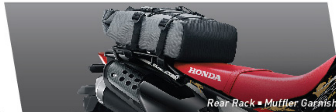
Rear Rack • Muffler Garnish